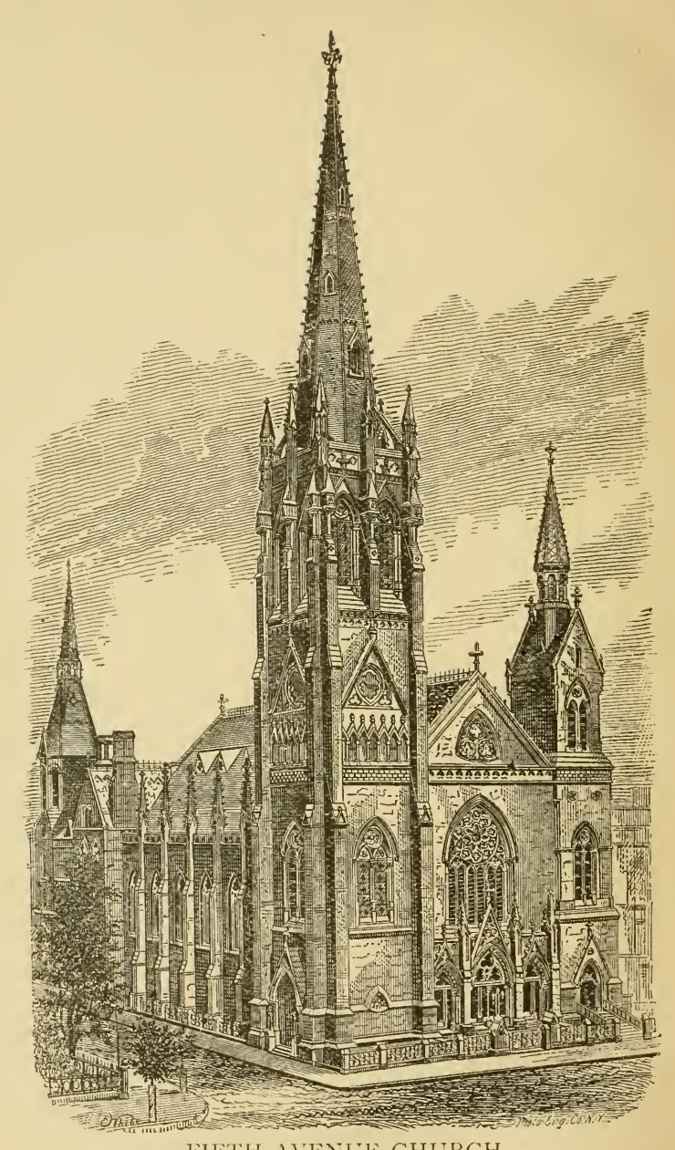
FIFTH AVENUE CHURCH, ERECTED 1875.