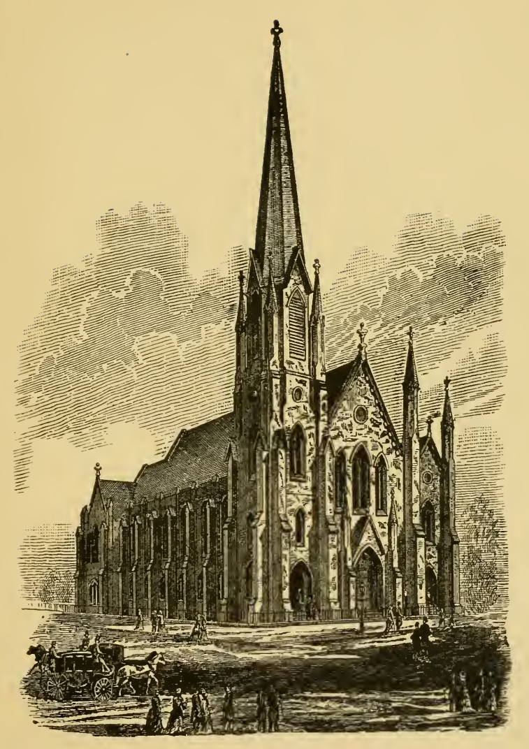
FIFTH AVENUE AND NINETEENTH STREET CHURCH, ERECTED 1852.