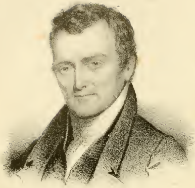
Prof of Theo in the Theo Sem Princeton NJ