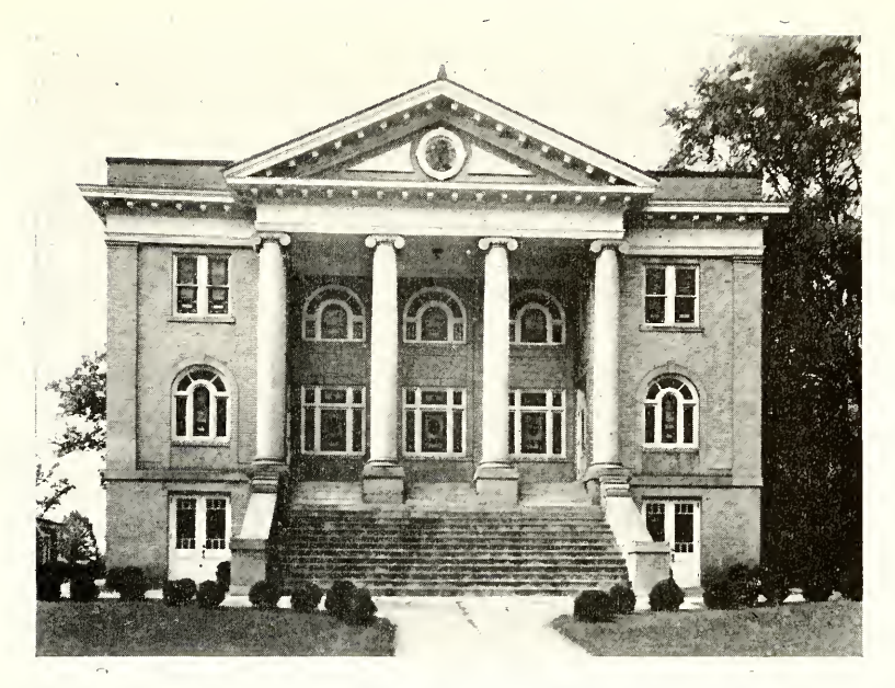
Cornerstone Laid — 1922 Dedicated — September 5, 1943