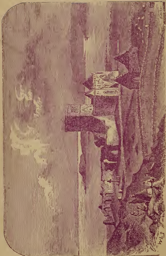
THE RUINS OF IONA.