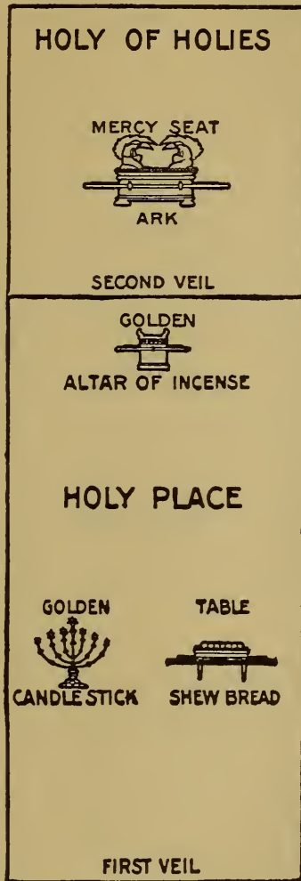
DIAGRAM of the TABERNACLE AND ITS FURNITURE